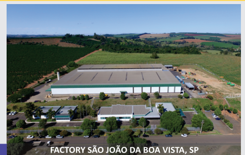
FACTORY SÃO JOÃO DA BOA VISTA, SP

Spreaders line JF, the solution for the farmer!