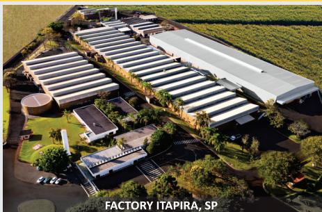
FACTORY ITAPIRA, SP