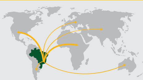
FROM BRAZIL TO ALL CONTINENTS OVER 50 COUNTRIES