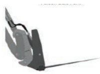
F750 Falcon Bale Fork