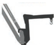
Falcon Swivel Hook