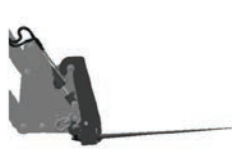
F1000 Falcon Bale Fork