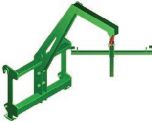
JCB Q-Fit® Bag Handler

RELIABLE, EFFICIENT AND COST-EFFECTIVE SUBSTITUTE FOR FRONT-END LOADERS