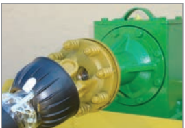
PTO shaft and slip clutch

All implements are supplied with appropriate, fully guarded PTO shafts. Torque-limiting slip clutches are supplied where specified. Optional over-run or freewheel clutches can be supplied if required.