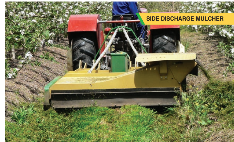
SIDE DISCHARGE MULCHER