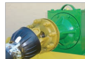
PTO shaft and slip clutch

All implements are supplied with appropriate, fully guarded PTO shafts. Torque-limiting slip clutches are supplied where specified. Optional over-run or freewheel clutches can be supplied if required.